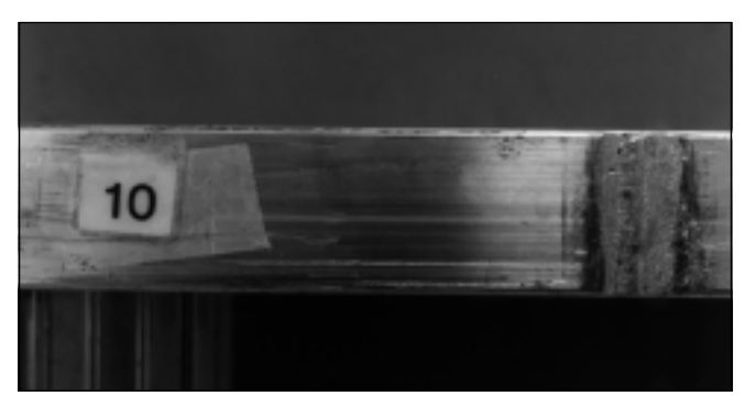
Fig. 2a Loosely Tied Ladder Flange Damage

8.4.4.1 Truck Racks. Ladders shall be secured to the truck rack in a manner that will avoid chafing from relative horizontal and vertical motion. The ladder feet, when present, should be secured from pivoting about the ladder while the vehicle is in motion. The ladder truck rack shall be designed to positively secure the ladder into a fixed position, and the rack should be designed to fit the particular ladder being fixed to the truck. If these requirements are not satisfied, excessive wear of the ladder will occur which will cause premature deterioration of the ladder and reduce its service life. Improperly designed and used truck racks may damage side rails, steps or rungs, feet, and other ladder parts, owing to vehicle vibration and road shock.