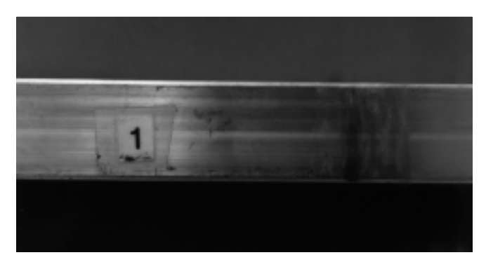
Fig. 2b Securely Tied Ladder Flange Damage

A test was conducted with two 32-foot aluminum extension ladders (16 feet in length when retracted) situated with a 6-foot overhang beyond the front tubular steel support of a roof rack shown in Fig. 1. One of the ladders was loosely tied so that the ladder could rise above the roof rack supports. The other ladder was securely tied with rope to each of the three supports on the roof rack. Simulated road shock of one-inch amplitude was imparted to the roof rack for 95,000 cycles. Every cycle resulted in an impact to the same location of the